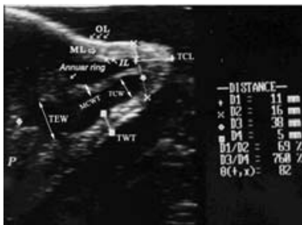
Figure 1: Sagittal scan of the camel teat in a water-bath showing the annular ring as a hyperechoic area. Three layers of the teat wall can be identified. OL (outer layer), ML (middle layer) and IL (inner layer); P (udder parenchyma); TCL (Teat Canal Length); TEW (Teat End Width); TWT (Teat Wall Thickness); MCWT (Middle Cistern Wall Thickness); TCW (Teat Cistern Width). The sonogram was obtained with 7.5 MHz linear array transducer.

ultrasonographic appearance of mammary gland and teat in lactating camels. It is very important for further understanding of the mammary gland problems such as mastitis, obstructive diseases and successful surgical treatment of the affected parts of the udder.