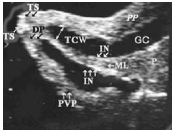
Figure 2: Sagittal scan of the camel teat in a water-bath. TS (teat sphincter), DP (ductus papillaries), TCW (teat cistern width), PP (plexus pempiniferous), GC (gland cistern), P (parenchyma), PVP (plexus venous pempiniferous). Three layers of the intercisternal wall can be identified: IN (inner layers), ML (middle layer). The sonogram was obtained with 8.5 MHz linear array transducer.

Clinically normal udders of 10 lactating camels at different ages (5-12) from slaughtered animals in Rafsanjan abattoir ( camelus dromedarius ) were examined in situ , after isolation from the carcasses. The collected udders were immediately transported to Kerman Veterinary Faculty for further ultrasonographic evaluation. One of the teats was attached to a tripod with two clamps; the space between the gland cistern and the teat cistern was filled with 5 ml normal saline. The teats and udders were dipped in a water-bath and examined with B-mode real time ultrasonography by a portable ultrasound machine (Sonoace 600v; Kretz-Technik) equipped with a 6.5-8.5 MHz (7.5 MHz median frequency/60 mm foot print) linear array multi-frequency, waterproof transducer. The transducer was placed in close contact with the glands and teats in the water-bath. Since the teats were not completely circular, the position of the probe on the teats during the experiment was partially held unchanged. The